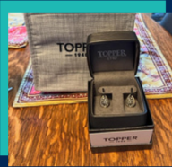
Topper Jewelry Earrings