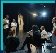
Bay Area Theatre Package: 2 tix to City Lights Theater and a 2 tix to TheatreWorks