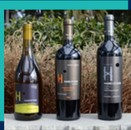
Case of 'Hand of God' Wine