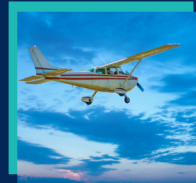
Peninsula Flight (introductory) with Certified Pilot from San Carlos airport